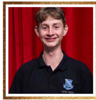
Edward Valley Follow Spot